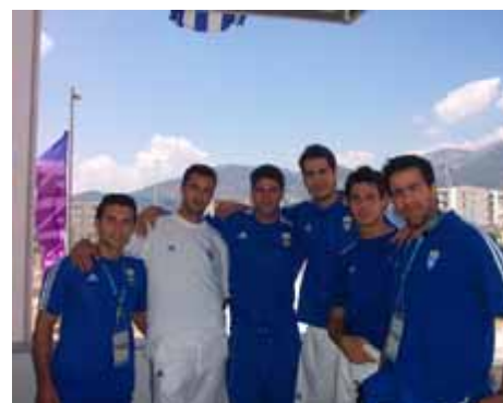
Greek Handball Team players

After the Athens Olympics, the team will start preparing for the World Championship in 2005 and they seem to be very happy with the prospect. Their advice to their fans who would like to follow their example is: "We love our sport so much, that, although