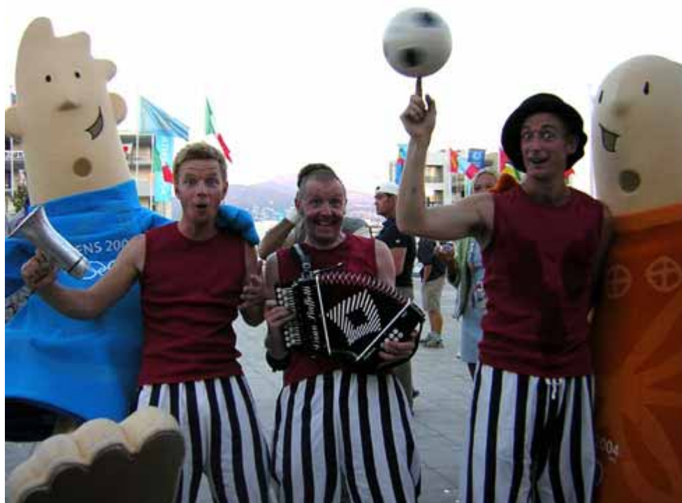
CHIPOLATAS street theatre team with Athena and Phevos