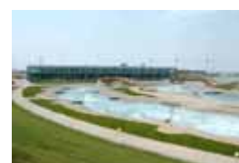
11 June 2004

As the workforce, we have got to know each other very well, so when we meet at the end of the day to have the standard meetings for reports we hardly need words to express our satisfaction with ourselves. Just a look or a smile, and it is enough to describe the good results of the day, for the outcome of the day is fortunately good, as a rule.