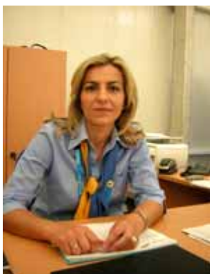
Georgia Dalakosta Post Office Greece

At the Ancient Olympic Games mail was sent by pigeon (hence the phrase 'it's not my pigeon'). In the 21st century it is sent by sparrow. Visit the Olympic Village Post Office and you will see it for yourselves. A sparrow has nested in the shop's awning. It seems the return of the Olympic Games to their homeland is a real flesh and blood one.