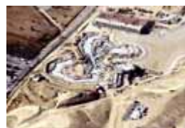
17 March 2004