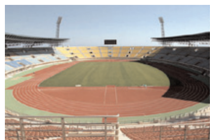
22 June 2004

Heraklio's Pankritio Stadium has already acquired its true name - the jewel of Heraklio, as befits such a venue, at the estuary of the river Giofyros and a few metres only from the Lido promenade. Here twenty-six thousand spectators will be able to enjoy any sporting competition, wherever they are sitting on relation to the field of play; and particularly the matches of the Olympic Football Tournament that began yesterday with games between the national women's teams from Greece and the USA and the national men's teams from Tunisia and Australia.