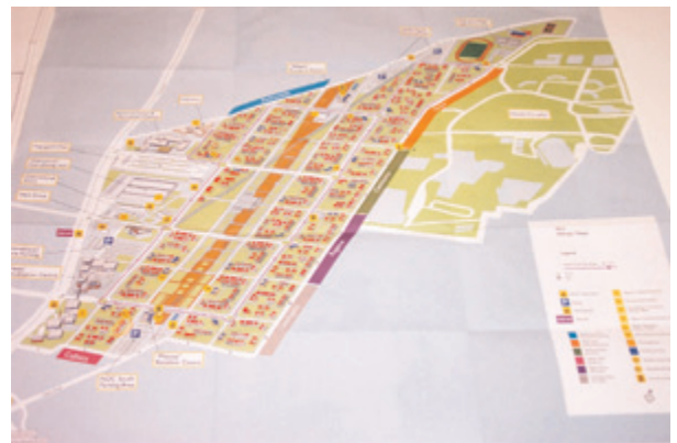
Is this a map of San Salvador, or what?

This Village is a proper mosaic. It is very easy to get your bearings in the Residential Zone. Huge flags in six bright colours line the streets letting you know which zone you're in. These six zones have the names of constellations which, starting on August 13th, will shed their light on the stars of sport.