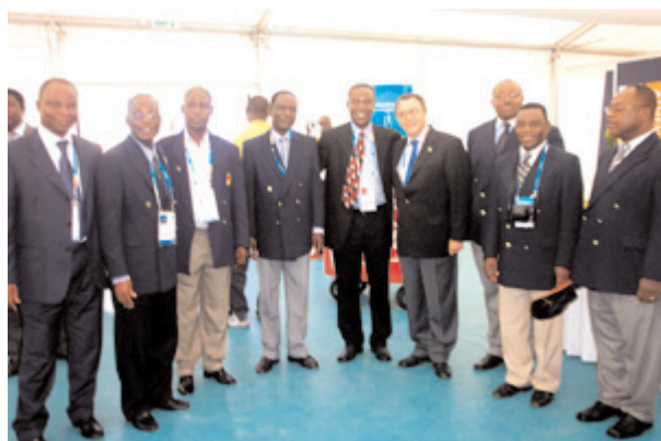
The Olympic Village Welcomes the Delegation of Ghana

Among the athletes that we are expecting in Greece are Ghana's football team, the Black Meteors with their Portuguese coach. The congratulations for Greece's Euro2004 victory were quickly captured by the exaltations of a possible victory (1:2 for Ghana) over the recent Champions and Olympic Games hosts. However, since the comment was supported with the caveat that the two teams would meet in the Finals, we thanked him for his support and agreed that the best team should win!