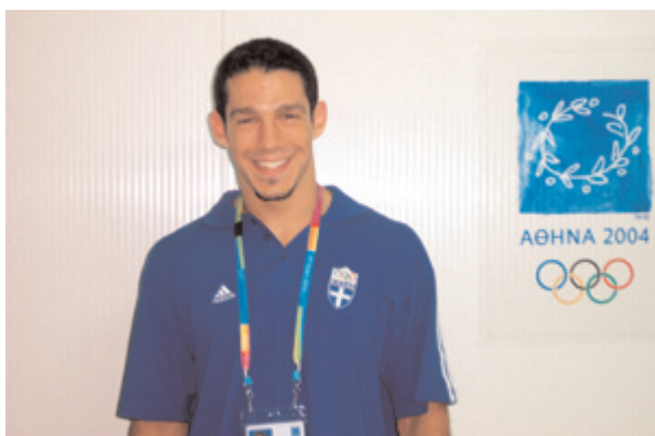
The Eye of the Tiger