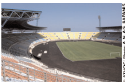
24 March 2004