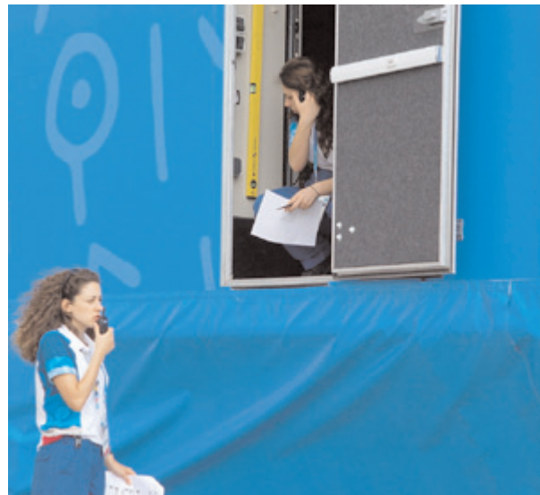
Happy to be in Greece