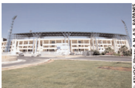
15 June 2004