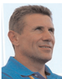
Sergey Bubka Olympic Pole-vault champion Ukraine

"One person I admire is Allen Iverson who's on the USA Basketball team. I'm a Basketball fan, having played at High school in Philadelphia, that's where Alan is from, too. I'm also running everyday and will run in the Olympic Torch Relay for the UNHCR."