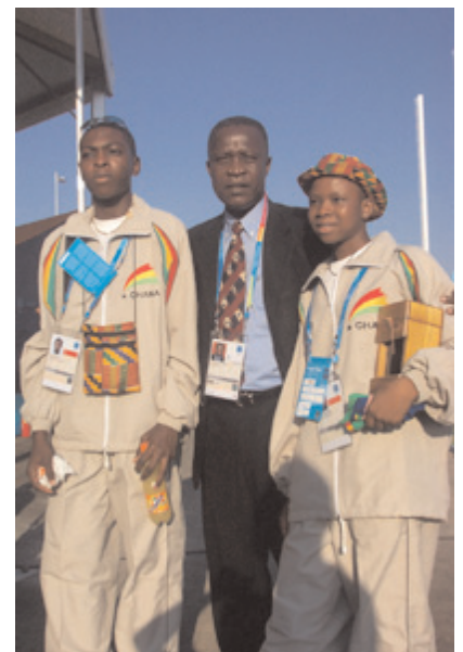
The Honorable Minister Kwadwo Baah - Wirendu of Education, Youth and Sports

When asked about the athletes' expectations, the Minister confirmed that they had arrived and would spend time with the Minister later on in the day. Ghana's Chef de Mission, Albert Edem Agbora, was close at hand and we expect to see more of him in the Olympic Village once the life picks up with more cultural flair.